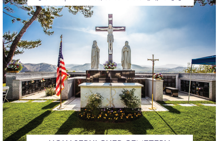
HOLY SEPULCHER CEMETERY

13280 Chapman Avenue, Garden Grove • (714) 282-3052