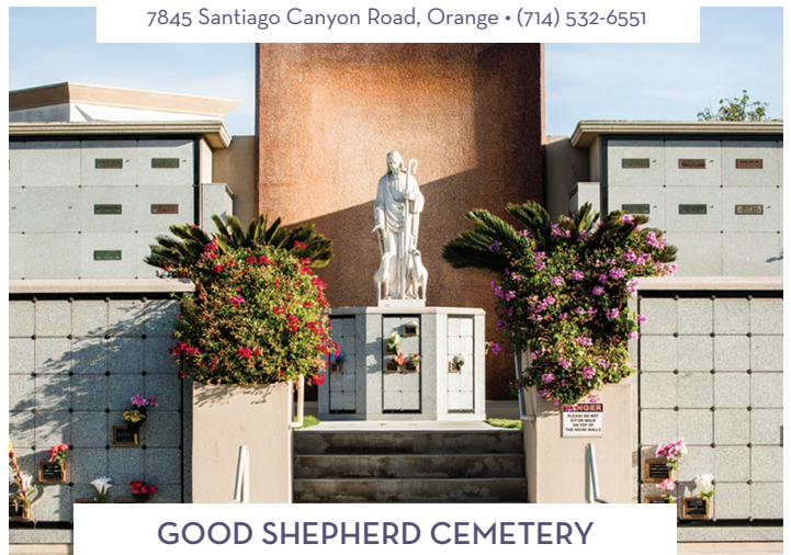
GOOD SHEPHERD CEMETERY

7845 Santiago Canyon Road, Orange • (714) 532-6551