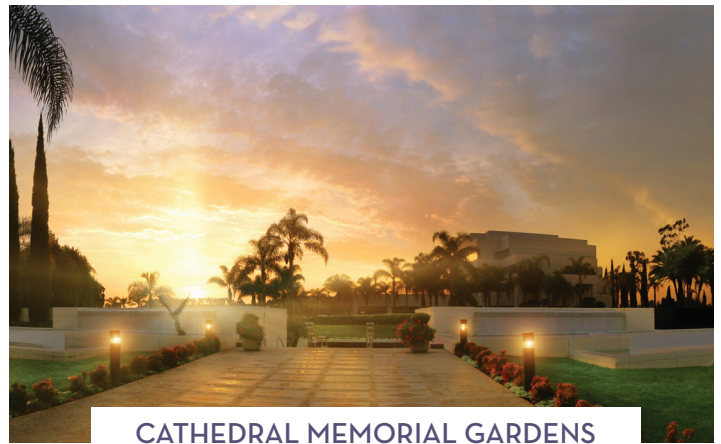
CATHEDRAL MEMORIAL GARDENS

13280 Chapman Avenue, Garden Grove • (714) 282-3052